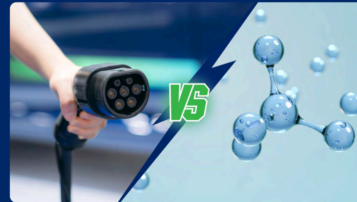
Example: Feature image or gallery image at 1920×1080 pixels

If this data is not provided, the editorial team of TrucksNL will add the OG image, title and description themselves. TrucksNL may add its own branding or logo to the OG image, always with respect for the message, the client and the author of the article.