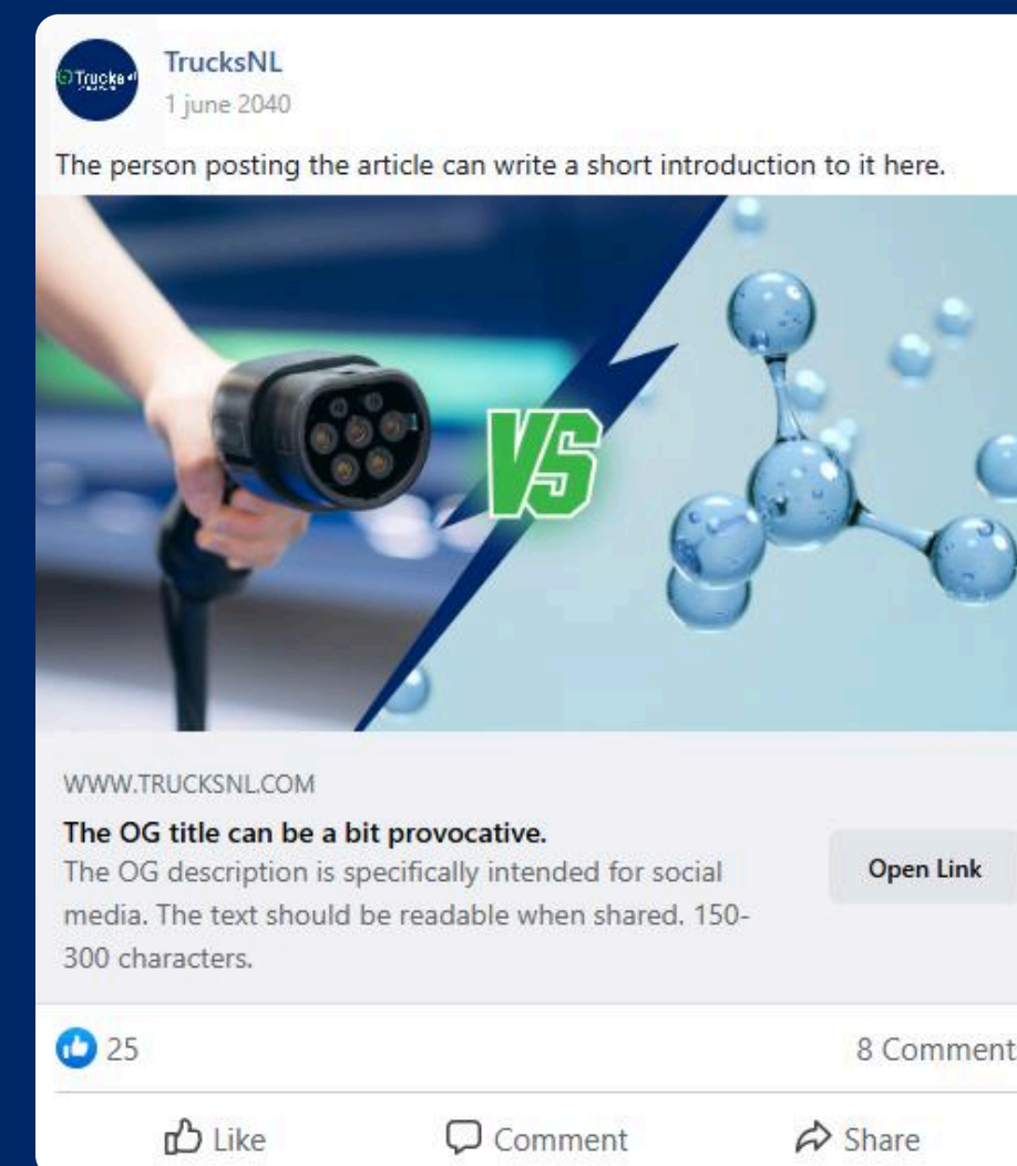
Example: Post on Facebook. The OG image, title, and description are displayed here.