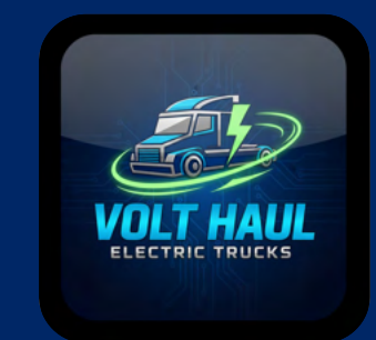
Examples: Author photo or company logo at 128×128 pixels