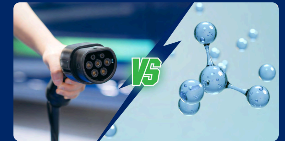
Example: Social image or OG image at 1200×630 pixels